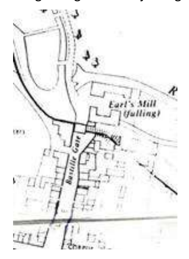
Site of mill & Gate

took over the mill. It comprised of six bays, with cornmills for wheat, for maslin (a mixture of rye and wheat) and rye and for oats and several pieces of land and an orchard. He was granted a lease for 21 years at £6 per annum. His lease was further extended for 31 years in 1676 when he agreed to set up 2 further bays. This was a lease of Bastille Mill & the messuages adjoining, a piece of ground by the town wall, a piece of ground lying between 2 streams, a garden adjoining the mill, tenements and cottages & gardens adjoining in Mill Lane and of the tower near