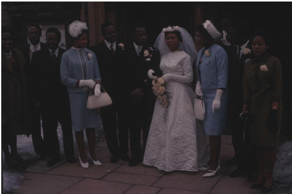
Caribbean wedding c.1960-1970