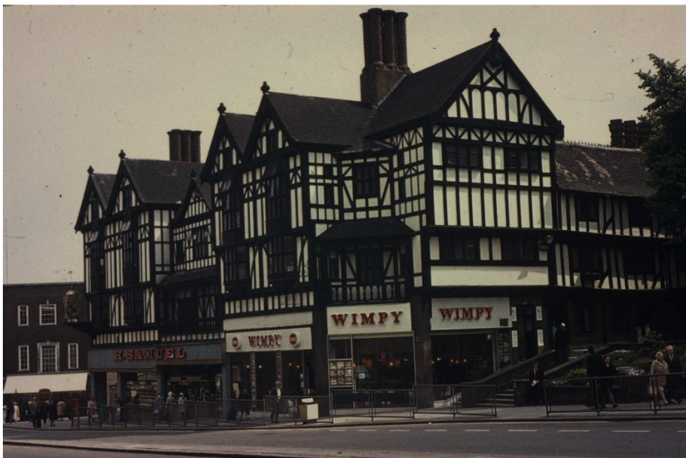
Trinity Street, June 1973. Coventry's third branch of Wimpy, currently occupied by the Flying Standard pub