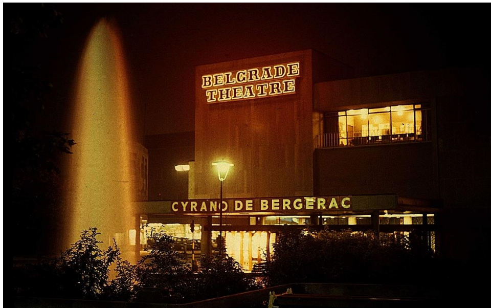
Belgrade Theatre, 1969