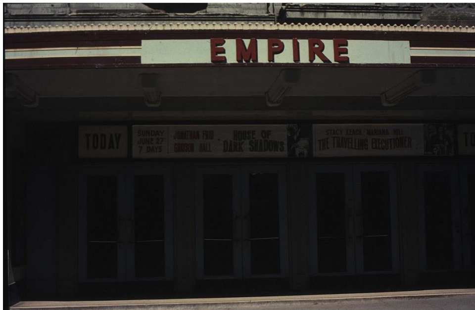
Empire Theatre, 1971 (Now demolished. The collection of slides documents the demolition)