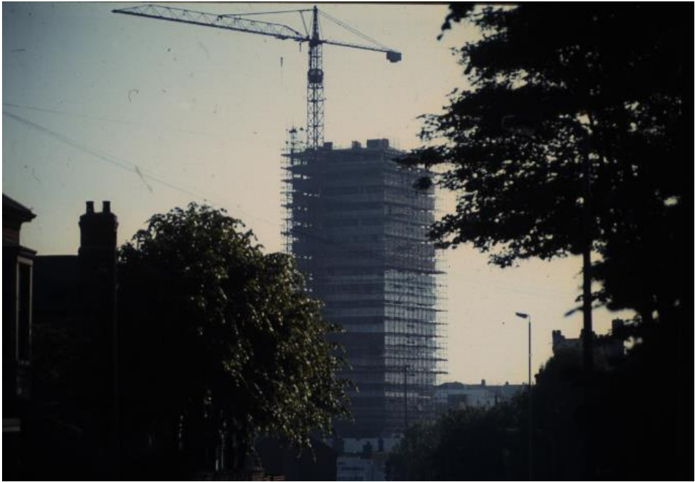
Mercia House c.1960-70