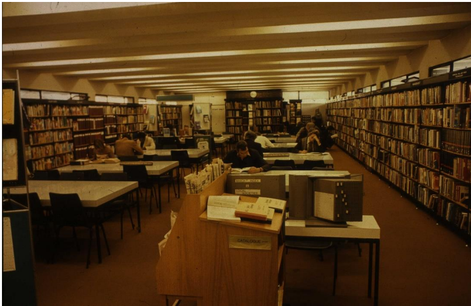
Coventry Library, September 1975