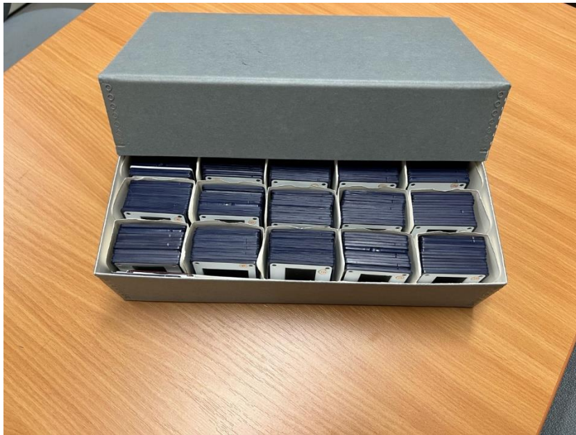
Film slides stored in archival quality enclosures and box

The optimum storage (cool, dark, dry, not subject to extremes of temperature and humidity) of the Audio-Visual strong room has meant that the slides have not degraded and remain in excellent condition. Whilst dyes inevitably fade over time, luckily the majority of the slides found were on Kodachrome, which is known to fade slower than other film stock.