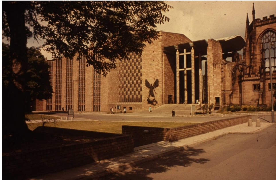
Coventry Cathedral, 1973-4. Some sights remain unchanged