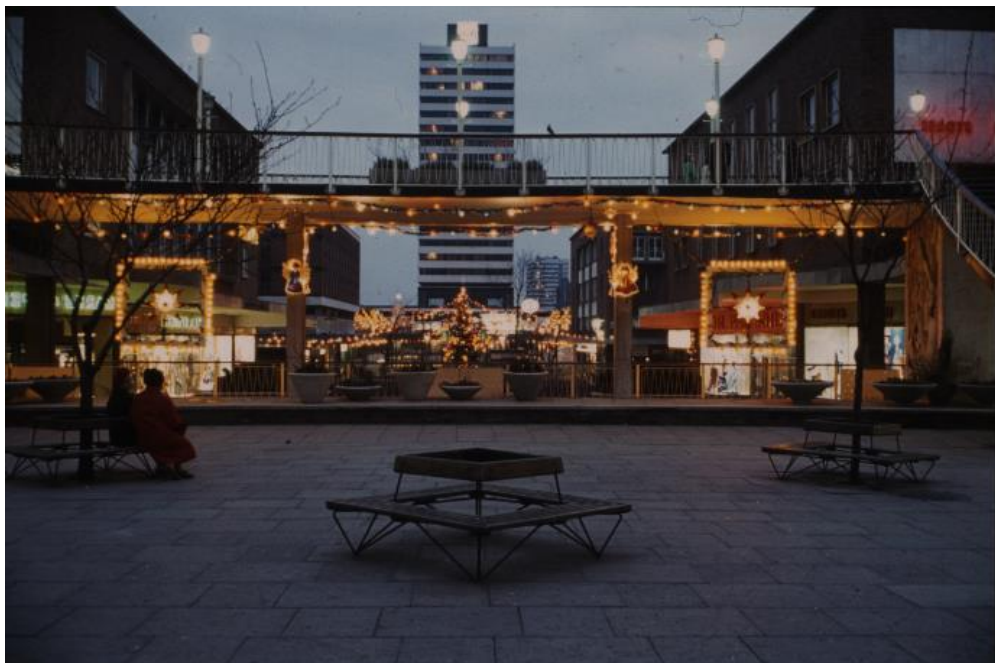
Coventry city centre at Christmas c.1960

The slides found largely date from between 1940 -1999 and depict a variety of subjects such as views of Coventry, mapping the striking transformation of the city, gatherings & events, communities, and even some in a domestic setting. Below is a selection of some of our favourite images: