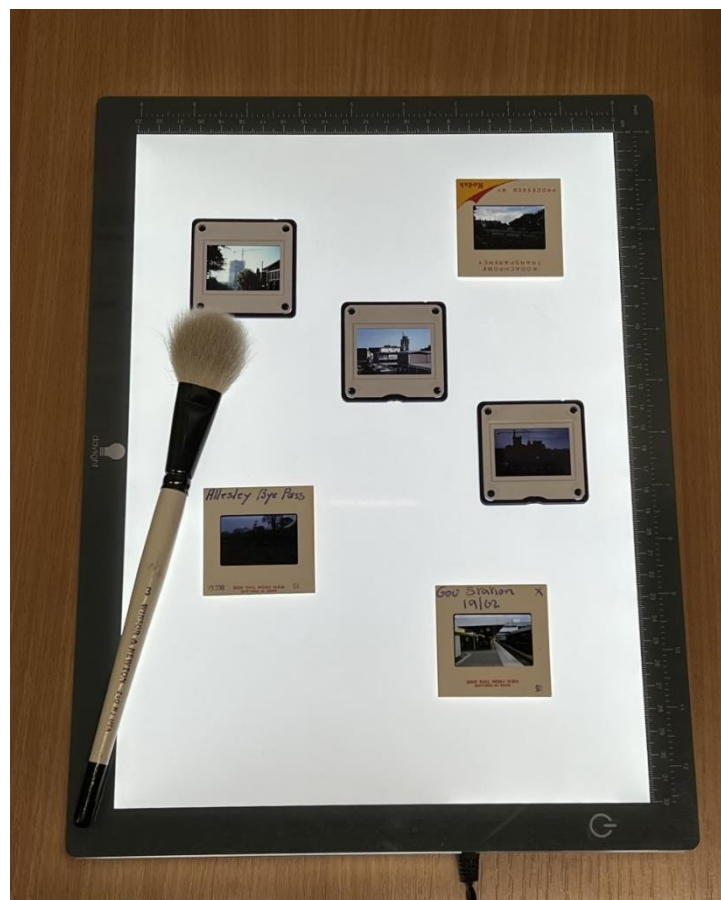
Slides were viewed using a light box and cleaned with a brush

As with most archival collections, on deposit, they do not arrive in appropriate storage, therefore the first step was to remove the slides from the original plastic boxes, clean the surface of the film (using a conservation grade brush), and place the slides into archival quality enclosures and boxes, pictured below: