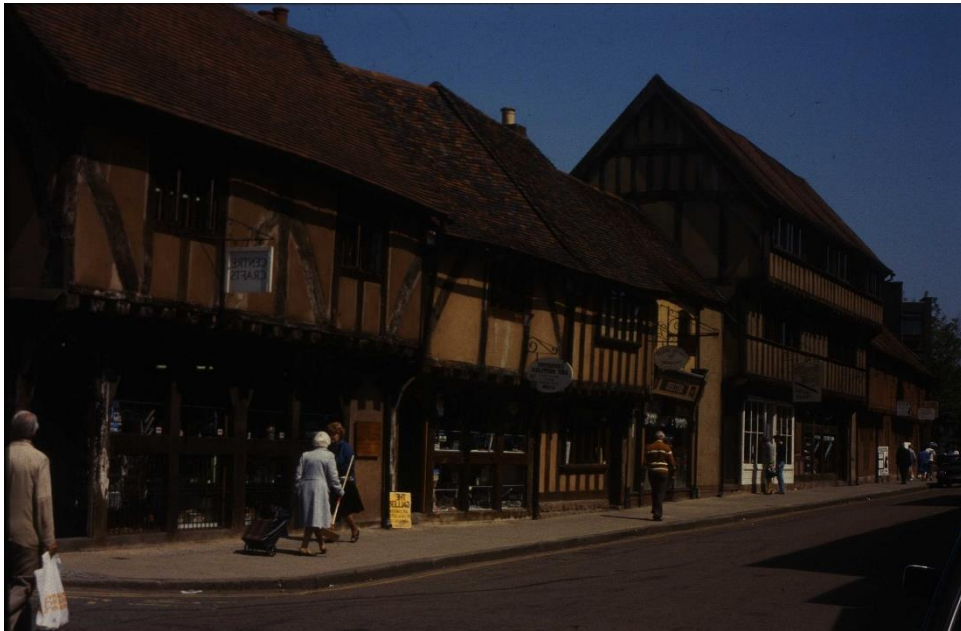
Spon Street, May 1987